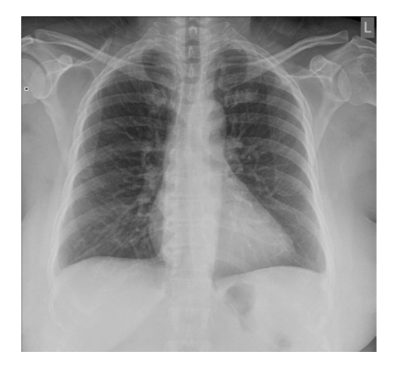
Figure 4 Chest radiograph showing resolution of the rightsided pleural effusion. Minimal blunting of costophrenic angles are seen on both sides. Ultrasound of the thorax showed no pleural effusion or thickening on both sides.

malignant effusions in around two-thirds of cases [10]. Addition of the cell block technique to fluid cytological analysis augments the diagnostic yield of malignant pleural effusion [11]. The routine use of CT of the thorax in evaluation of pleural effusion is futile and only ends up in increasing the cost of managing such patients [12]. If a CT chest is required, it should be done after aspirating the pleural fluid so that the underlying lung parenchyma can be easily visualised. This is useful in moderate to large pleural effusions. Contrast infusion protocols should be modified in these patients so that the pleural surfaces are seen better [13]. A CT pulmonary angiogram should be performed in cases where pulmonary embolism is suspected as almost half of these cases are found to have pleural effusion [14]. Pleural fluid tumour markers may have a role in diagnosis of malignant pleural effusions where the cytology is negative and there is a high pretest probability of malignancy [15]. Pleural fluid ADA has a good diagnostic accuracy for tubercular pleural effusions in high prevalence areas [16]. Closed pleural biopsy is the next step in the evaluation of aetiology of pleural effusion when the clinical features and pleural fluid analysis have been inconclusive. Addition of image guidance increases the yield of the procedure. It is easy,