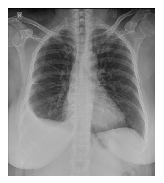
Figure 1 Chest radiograph showing mild right-sided pleural effusion, no mediastinal shift and normal lung parenchyma.

Sputum, urine and blood cultures were sterile. Serological tests for common respiratory bacteria and viruses were negative.