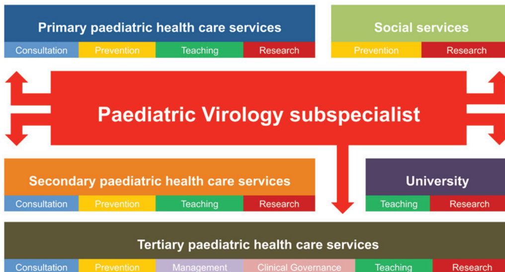
Figure 2. The proposed multi-task role of Paediatric Virology subspecialists in primary, secondary and tertiary paediatric services, university-based research and educational settings.

atric viral infections and will focus on their comprehensive assessment and treatment. Moreover, they will enhance the coordination of hospital and community care teams and offer appropriate consultation and assistance. After their qualification, Paediatric Virology subspecialists will play a multi-task role, not only in university-based research and educational settings, but also in primary, secondary and tertiary paediatric services (Fig. 2). Their increased accessibility can potentially result in cost savings to the health care system and better quality of care for paediatric patients. This will be achieved by limiting the unnecessary utilisation of emergency rooms, the multiple clinical visits to various health care providers and the request of unwarranted investigations.