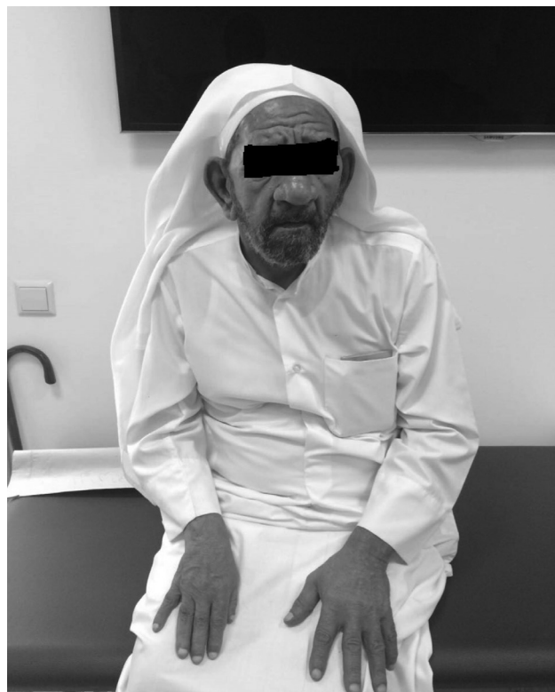
Figure 2 - Picture of the patient showing right sided facial and body atrophy.