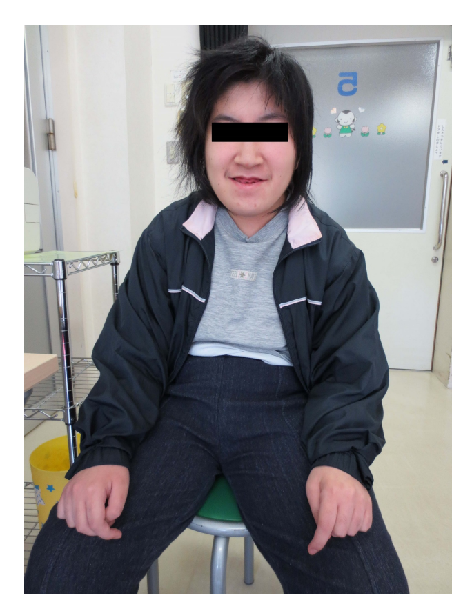
Figure I The present patient, a 29-year-old female.

At the age of 27 years, she suddenly became inactive and began neglecting her regular household chores. She refused to go to work and became withdrawn; she did not watch television, an activity she previously enjoyed. She was expressionless, was unkempt, and had stopped eating and bathing by herself. She suffered from insomnia, and her mood was unstable, irritable, and aggressive. She developed sluggish movements; talked to and laughed at herself; occasionally cried, shouted, and got irritated; and distressed her family.