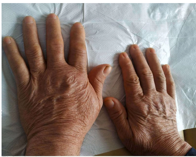
Fig. 2. Left hand arthritis.

increase was seen in thoracic kyphosis. In the patient history, there was seen to be ankylosing spondylitis for approximately 30 years. There was no history of peripheral arthritis or psoriasis. The patient had been previously followed up at another centre and had used non-steroid anti-inflammatory drugs (NSAID) at different times. Sulfasalazine was used for approximately 7–8 years, but not in the last 10 years. Infliximab was used for 6 years with the last dose taken approximately 2 years ago. For the last 2 years the patient had used low-dose NSAID or paracetamol when in pain. Nasopharyngeal and oropharyngeal swabs were negative for COVID-19. The pulmonary radiograph examination was normal. The patient had not contracted COVID-19. In the laboratory tests, ESR and CRP were elevated (ESR: 85 mm/h, CRP: 11.2 mg/dl). The full blood count, uric acid and urine analysis results were normal. Rheumatoid factor, anti-nuclear, and anti-cyclic citrullinated peptide antibodies were negative. HLA-B27 was positive. Brucella, Hepatitis B and C, serology were negative in serum. Treatment was started of 10 mg/day prednisolone. The complaints of the patient were reduced during follow up and a steroid tapering program was applied. The arthritis did not recur.