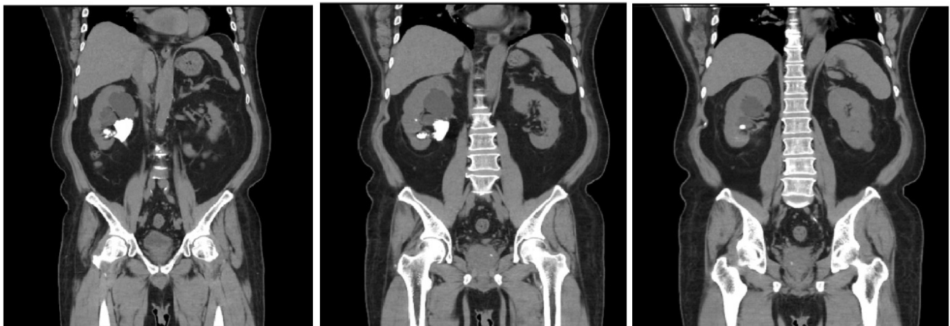
Figure 1. Initial computed tomography (CT) urography. The first CT Urography of the patient shows right staghorn stone with grade 3 hydronephrosis and left kidney cyst.

Almost two years later (January 2018), routine KUB imaging and CT urography showed no change in his right nephrolithiasis ( Figure 3h, i ). In June 2019, he was persuaded by his family