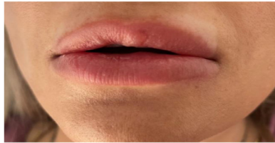
Figure 2. Result after 5 days using methylprednisolone [Au24].

tous nodules were visible on both the upper and lower lip with mild pain were visible from day 2 post-vaccine. These nodules disappeared completely in 7 days with no medical intervention. On February 11, 2021 the patient proceeded with her second dose of the Pfizer vaccine. On April 13, 2021 the patient complained a mild tenderness on her upper lip and two days later a painful erythematous oedema was developed on both the upper and lower lip (Figure 1).