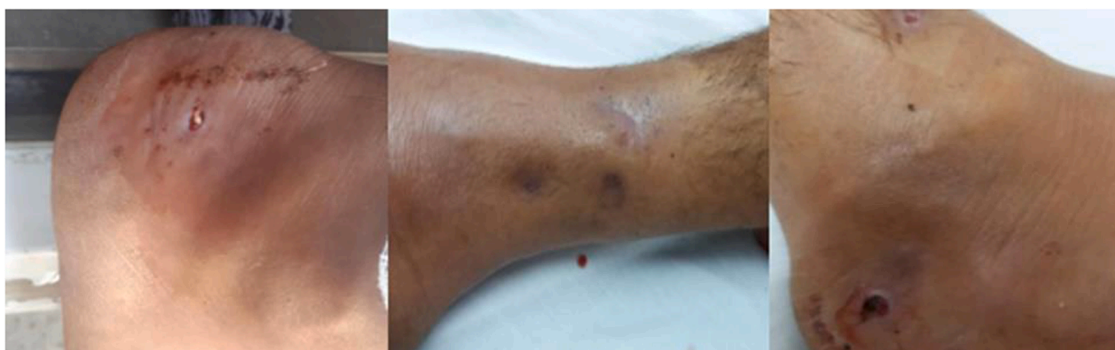
Fig. 1. Swollen and discharging lesions on the right foot of the patient at first visit.

In the past decade, many species of fungi such as Aspergillus , Candida , Fusarium , Cryptococcus , etc. have appeared as a considerable cause of morbidity and mortality in human and animal infections worldwide [16–18,58,59]. Aspergillus species are opportunistic microorganisms, globally distributed in air, soil, and plants, and the majority of cases reported occurred in patients with predisposing conditions such as hematologic malignancies, steroid use, human immunodeficiency virus, diabetes mellitus, etc. [19–21,60]. In patients with immunodeficiency, a more severe disease that may eventually destroy tissues including bones may occur [22–24,61]. The case of A. flavus mycetoma infection