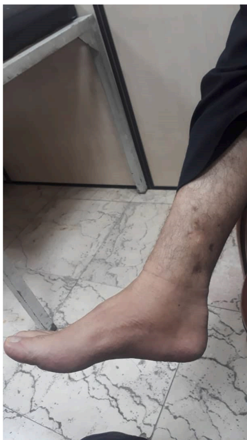
Fig. 4. Improved lesions of the patient in one year follow.

disintegration of the growth and sporulation pattern of the isolated strain, the morphological identification could not be specifically definite to the species level thus, further molecular evaluation became paramount for precise identification of the fungus [1]. DNA sequencing data unambiguously showed that the strain was A. flavus . Table 1 summarized all cases of mycetoma due to A. flavus reported across the world.