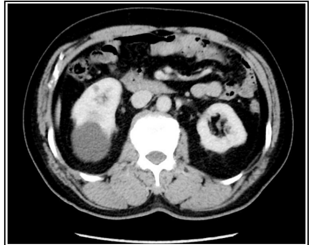
Fig.2: Enhanced CT.

As annual physical examinations become widely adopted, the diagnosis rate of simple renal cyst has gradually increased. However, since simple renal cyst progresses slowly and often has no significant effect on renal function, the condition is usually treated conservatively. Clinically, a cyst of less than four cm in diameter can be regularly followed up, to observe the changes in its size, morphology, and internal texture. 5 For cases associated with lumbar pain, hematuria, or a simple renal cyst of more than