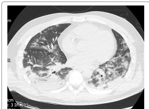
Fig. 1 Computed tomography Thorax showing considerable covid pneumonitis

Blood tests revealed a C-reactive protein (CRP) of 150 mg/L, but full blood count, clotting studies, and thyroid, renal, and liver function all returned normal. Hemoglobin A1C (HbA1C) was raised at 109 nmol/mol, and a random lipid profile revealed raised triglycerides (5.24 mmol/L) and non-HDL cholesterol (3.58 mmol/L) along with reduced HDL cholesterol (0.92 mmol/L).