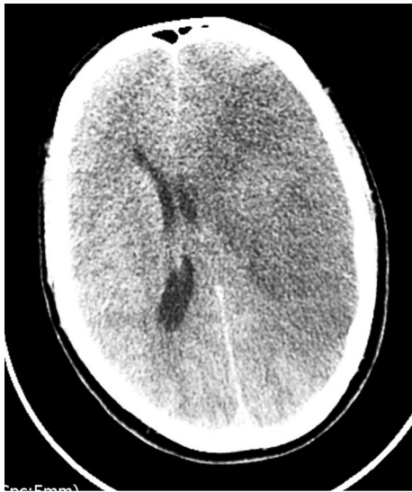
Fig. 3. Computed tomography Brain showing L-sided oedema with mass effect

was managed conservatively and unfortunately died that evening.