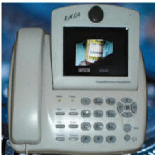
Figure 2 Videophone.

Treatment sessions for the Telepsychology condition will be conducted using in-home videoconferencing technology. We will use an analogue videophone (KMEA TV500SP, Figure 2) that operates via plain old telephone service (POTS). Apart from the video screen, this equipment appears and functions much like a basic touch-tone telephone. It is a "plug-and-use" product, with built-in camera, full duplex speakerphone, 4-inch LCD color screen (270 K pixels) with real-time motion display (18 frames per second), and oversized touch-tone buttons for easy use by all patients. This equipment is simple to use. If necessary, project or clinic staff will be available to visit participants in their homes to help set up the equipment. We will track the type and amount of assistance required across sessions in order to help anticipate future difficulties with in-home use.