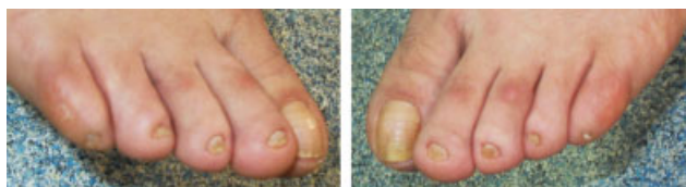
Fig. 3 Nail hypoplasia of the third patient.

RUNX protein contains a highly conserved QA, Runt, and PST domains, which are rich in the amino acids. c.1171C>T mutation may have effects on PST domain which has a crucial role in both transactivation and transcription repression. 12 Our second case with heterozygous splice site IVS4+4 delAAGT mutation on runt domain may consequently affect this functional part of the protein. Although she had severe dental abnormalities, she had a milder CCD phenotype than the other two patients. Evaluating her family results indicated that the probanda of the second family had de novo