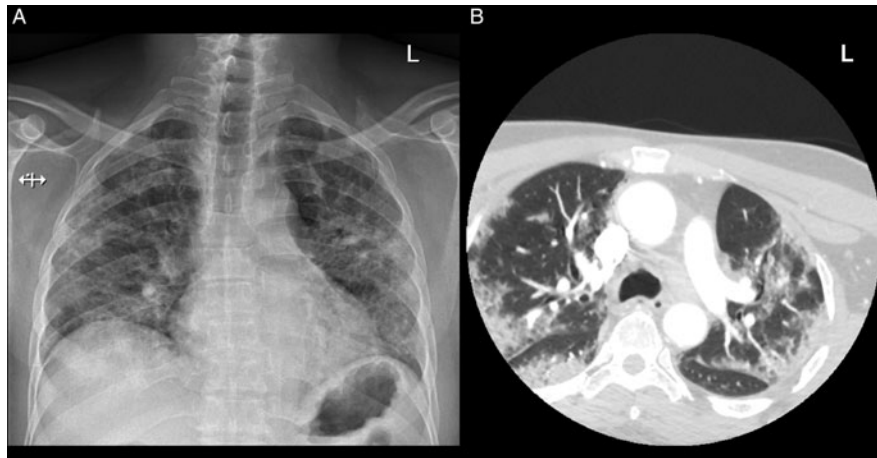
Figure 1: Lung imaging. (A) Chest x-ray demonstrated diffuse heterogeneous infiltration in both lungs and corresponded with (B) CTA of the head and neck, which demonstrated ground-glass opacities in the lung apices, involving primarily the periphery in the upper lobes of the lungs and the superior segments of the lower lobes. These findings were consistent with COVID-19. L = left.