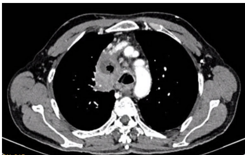
Figure 2 Thymoma with invasion of right brachiocephalic vein and right lung upper lobe.

mediastinal tumors resection and the limitations of this approach should not be considered as its disadvantages. Most of its disadvantages like high infrastructure costs and limitation of tactile sensation were similar to any other minimally invasive procedure. However, in infants and smaller children paediatric VATS demands very small calibre instruments which may not be easily available. Due to lower incidence of cases and technical and structural problems there is a slower progress in achieving experience in VATS even among purely paediatric centres (78). This leads to scarcity of adequate training facilities when