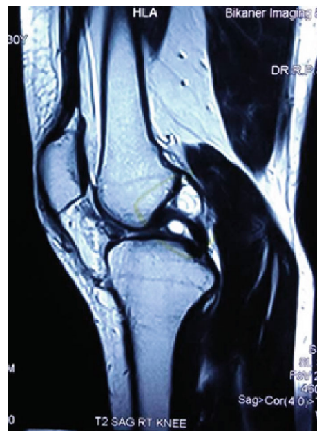
FIGURE 1: Sagittal section of MRI showing cyst between the femoral attachment of two cruciate ligaments.