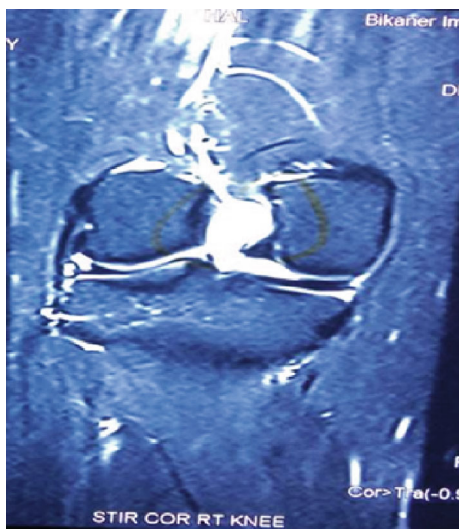
FIGURE 3: Coronal section of MRI showing cyst between the femoral attachment of two cruciate ligaments.

reported good results in 11 patients and Yu et al. in 12 patients using the standard anteromedial and anterolateral portals [2, 5]. Lunhao et al. showed good results in 16 cases and Parish et al in 15 cases with arthroscopy [11, 12]. Ultrasound, CT, or arthroscopic guided needle aspiration are associated with a higher rate of recurrence [2]. The prognosis after arthroscopic procedures is excellent as shown by Brown et al. with no recurrences [13, 14].