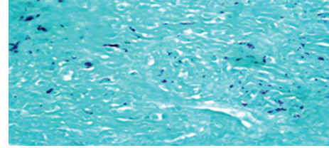
FIGURE 3: Acid fast stain of the liver biopsy which is positive for AFBs.

In conclusion, MAC peritonitis should be considered in patients presenting with non-specific abdominal symptoms in the setting of AIDS and low CD4 count. We believe that