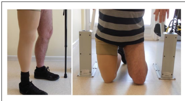
Figure 4. Fully assembled cosmesis undergoing clinical testing.

asked them to compare the initial fitting process of the standardized cosmesis with the new cosmesis. The second was issued at the follow-up appointment and asked them to rate the durability of the new cosmesis design after a period of use. At the initial fitting, clinical staff expressed negative opinions about the prototype cosmesis because it did not reduce manufacturing time (typically 3–4 h), they did not believe the zip would improve ease of maintenance and were not convinced by the aesthetics. However, following an inspection after the 10-week trial, clinical staff provided positive feedback. The prototype cosmesis was inspected by removing it from its prosthesis and replacing ('donning and doffing'). They found no evidence of wear and tear and agreed that the zip made it easier to don and doff the cosmesis (although there were issues with the design as noted above). They also agreed that the artificial patella improved the appearance of the cosmesis and the flexibility of the foam. The final and fully assembled cosmesis design is shown in Figure 4.