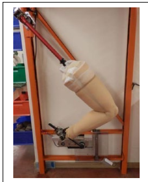
Figure 3. Durability test rig.

knee joint to return to the original position (Figure 3). The rig was also fitted with pedometers and a magnetic counter to record the number of cycles achieved before cosmesis failure. Failure was defined as a foam rupture visible on the external surface of the cosmesis. Foam rupture was identified using 24-h video recording, focused on the knee joint area where rupture typically occurs. Four prototypes were tested to failure.