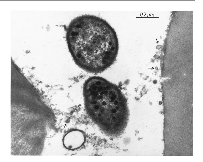
Fig. 3 Thin-sectioned sample of pulverized wood from American basswood stained with uranyl acetate and lead citrate, showing two cells of Gram-negative bacteria (presumably Pantoea agglomerans ) and numerous membrane vesicles (some marked with arrows) in the lumen of a wood cell, TEM (according to Dutkiewicz et al. 1992b)

Endotoxin-containing microvesicles (ECMVs) are easily inhaled by humans together with dust because of small dimensions and aerodynamic shape. Afterwards, they cause a nonspecific activation of lung macrophages, which release