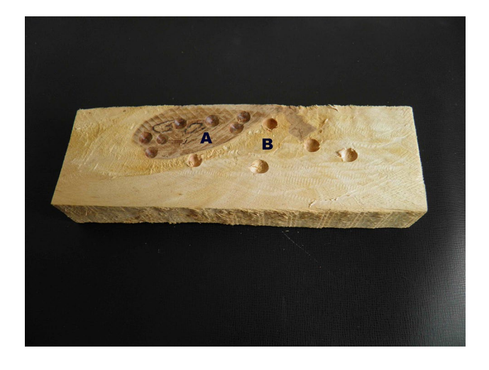
Fig. 1 Cylindrical block cut from the transverse section of birch ( Betula pendula ) log. A central, brownish ring; B peripheral, yellowish ring. Hollows in the wood indicate sites of sampling with the drilling device (according to Mackiewicz et al. 2019)

Considering the fact that immunopathologic reaction in HP is initiated by an exposure to large amounts of adverse factors, usually microorganisms, and therefore, the organisms prevailing in the material associated with evoking symptoms are almost surely the disease-causing agents (Towey et al. 1932; Pepys et al. 1963; Eduard et al. 1994; Milanowski et al. 1998; Selman et al. 2012; Nogueira et al. 2019); Pantoea agglomerans and Microbacterium barkeri were selected as antigens for allergological tests aiming to identify causative agent(s) of the disease observed in the patients. All the patients were examined with the inhalation challenge as a basic test and with the test for inhibition of leukocyte migration (MIF) and agar-gel precipitation test as auxiliary ones. In all tests, lyophilized saline extracts of bacterial mass were used in the doses