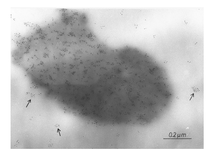
Fig. 4 Thin-sectioned sample of pulverized wood from American basswood immunostained with the rabbit antiserum against LPS of P. agglomerans and gold-labeled with anti-rabbit IgG. Structure corresponding to the cell of P. agglomerans is seen, stained positively with immunogold. Arrows outside the cell show aggregations of gold particles to smaller structures corresponding in shape and size to membrane vesicles, TEM (according to Dutkiewicz et al. 1992b)

numerous substances known as inflammatory mediators. Symptoms include an inflammatory lung reaction, chest tightness, fever, gas exchange disorders, and bronchospasm, without radiographic changes (Dutkiewicz et al. 2016a). Immunotoxic disorders caused by the endotoxin inhalation occur mostly in young people and are known under the names "organic dust toxic syndrome" (ODTS) or "toxic pneumonitis." In earlier studies, cases of this disease most