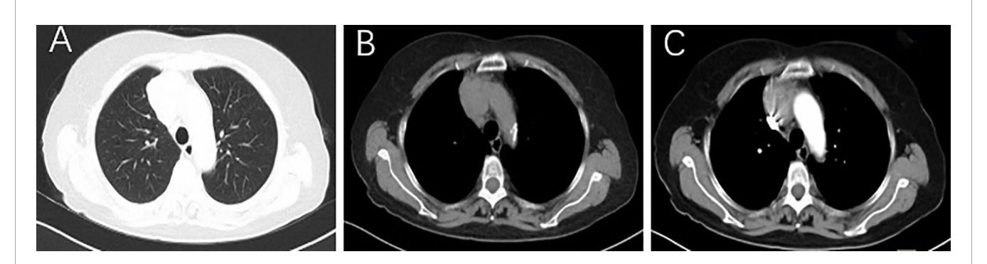
FIGURE 1 | Lung (A) and mediastinal window (B) of axial CT images show an irregular mass (about 5.1 × 3.5 cm) in the right anterior upper mediastinum, with inhomogeneous enhancement on contrast-enhanced CT (C).

Therefore, thymic LCH co-occurrence with type AB thymoma was considered. This patient also received radiotherapy after thymectomy (GTV5500cGy/25f, CTV5000cGy/25f). <sup>18</sup>F-FDG-PET/CT was performed ( Figure 3 ) and showed abnormal hypermetabolic regions in the chest, left femur, and right thigh, with the following maximum standardized uptake value (SUVmax): surgery-related changes of the sternum, 4.08; right atrial appendage, 7.08; a round mass with a size of 37 mm × 31 mm at the right upper thigh, 3.20; and left upper femur, 3.98. The patient underwent a biopsy for the mass of the right upper thigh in another hospital, of which immunohistochemical tests also proved the involvement of LCH. We could not be able to