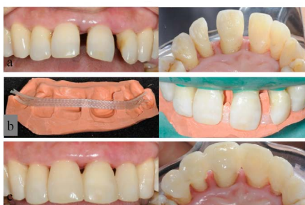
Fig. 3 Direct view of the clinical rehabilitation for a patient in the SV2 group. a) Frontal and palatal view of the upper dentition with disorder space between the central incisor teeth and left lateral incisor tooth; b) the putty (3M, ESPE) silicone rubber template was placed in the dentition with a quartz splint adhesive in the corresponding position; c) frontal and lingual view of the final restoration with direct resin veneers on the incisor teeth and left lateral incisor tooth