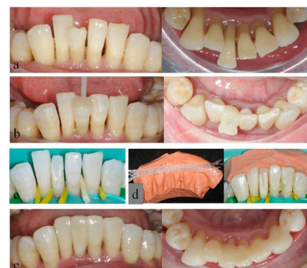
Fig. 2 Direct view of clinical rehabilitation for a patient in the SV1 group. a) Frontal and lingual view of the lower dentition with severe facial dislodgement of the right central incisor tooth; b) tooth restored with fiber post and dual-cure resin core material; c) the dislodged tooth was modified to restore a normal arch form; d) The putty (3M, ESPE) silicone rubber template was prepared and placed in the dentition with a quartz splint adhesive at the corresponding position; e) frontal and lingual view of the final restoration with a direct resin veneer on the dislodged tooth