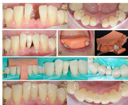
Fig. 1 Direct view of clinical rehabilitation for a patient in the SB2 group. a) Frontal and lingual view of the lower dentition with missing left central incisor tooth; b) the extracted tooth prepared for the pontic was temporarily fixed in the suitable position by a thin layer of flowable composite resin without adhesive; c) the putty (3M, ESPE) silicone rubber template was prepared, and the pontic and quartz splint was laid; d) depending on placement of the silicone rubber template in the dentition, the pontic and quartz splint adhesive was applied at the corresponding position; e) frontal and lingual view of the final restoration with a direct resin veneer on the pontic

Each unit of restoration was applied from canine to canine at the anterior segment of one jaw. Abbreviations: SB, FRC bonded splint-bridges; SV, combined restorations of FRC bonded splint and resin veneer; S, FRC bonded splints; SB1, SB in combination with fiber posts; SB2, SB without fiber posts; SV1, combined restorations of FRC bonded splint, resin veneer and fiber posts; SV2, combined restorations of FRC bonded splint and resin veneer without fiber posts; S1, S in combination with fiber posts; S2, S without fiber posts; OS, orthodontic retainer with FRC bonded splints.