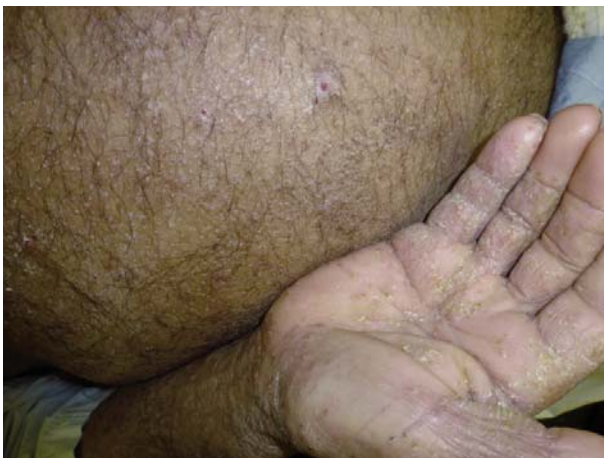
FIGURE 1: Burrows and honey-colored crusting in the palms with marked scaling and scratching lesions in the abdomen