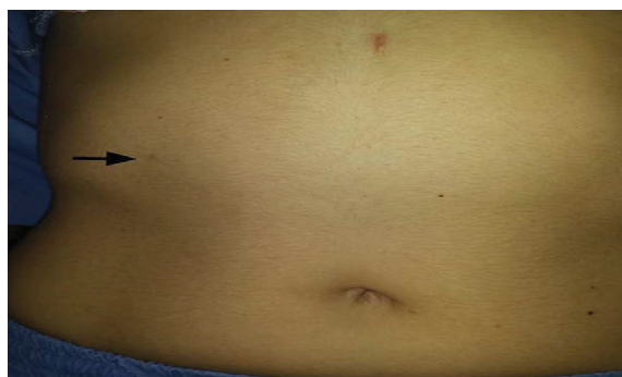
Figure 2 Cosmetic result 1 week postoperatively. Note: The arrow indicates where the MiniLap trocar was inserted.

the treatment of gallstone disease. The main contraindication for MLC is acute cholecystitis. Mini-laparoscopic instruments are thin, and the use of 3 mm graspers on thickened and inflammatory gallbladder walls potentially leads to frequent perforation of the gallbladder with contamination of the operative field. 7 Mini-laparoscopy can be proposed for approximately 50% of patients undergoing elective cholecystectomy. Antecedent abdominal surgery is not a limitation for this approach. 8