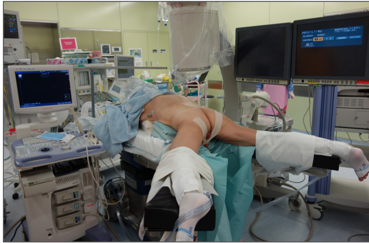
Figure 2 Patient positioning in the prone split-leg position.

removed successfully after retrograde lithotripsy with FURS, because of severe proximal encrustation of the stent. Renal puncture was achieved using ultrasonography under fluoroscopic guidance. An 18-Fr mini-PNL tract (Karl Storz) was used to dilate the tract and establish working access. To fragment the proximal encrustation and renal stones, lithoclast lithotripsy (Boston Scientific Japan, Tokyo, Japan) was performed using a 12-Fr mini-nephroscope (Karl Storz) (Figure 3d-f). Stones were broken into smaller fragments and washed