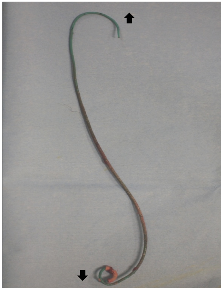
Figure 4 The retrieved stent. [↑] indicates the proximal side of the ureteral stent. [↓] indicates the distal side of the ureteral stent.