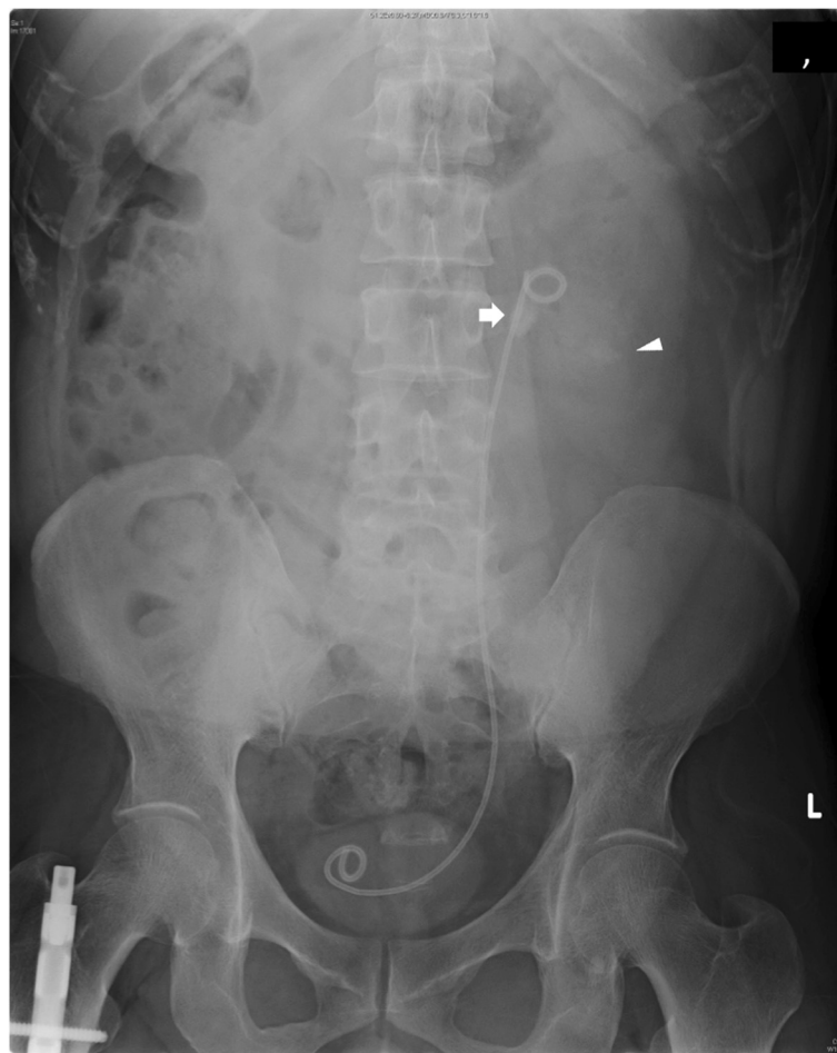
Figure 1 The kidney, ureter and bladder (KUB) X-ray shows a retained stent with stone burden in the ureter and kidney. The arrow indicates ureteral stones. The arrowhead indicates renal stones.

stent removal was attempted by combined endoscopic surgery using fURS and mini-PNL. The patient was oriented in the prone split-leg position throughout the operation, allowing both retrograde and antegrade access (Figure 2). The procedure was performed by two urologists working simultaneously to fragment the renal stones; one performed fURS (Figure 3a-d), and the other performed mini-PNL (Figure 3e-h). Flexible cystoscopy was performed to observe the stent encrustation and locate the ureteral orifice. The distal end of the ureteral stent was highly encrusted (Figure 3a). Under fluoroscopic guidance, the ureteral orifice was cannulated with a 0.035-mm guide wire that was passed into the upper urinary tract, and a ureteroscope (Flex X-2™, Karl Storz, Tuttlingen, Germany) was inserted beside the encrusted stent toward the ureteral stones in the upper ureteral tract (Figure 3b). The ureteral stones and the encrustation were fragmented using a Holmium-yttrium aluminum garnet (YAG) laser (a 200- \mu m fiber 1.5Hz 8H; VersaPulse® 80W, Lumenis Inc, San Jose CA, USA) (Figure 3c). The stent could not be