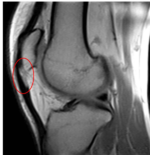
Figure 1. Magnetic resonance imaging caption showing insertional patellar tendinopathy (red circle).

The lack of basic knowledge on the aetiology and pain mechanisms associated with patellar tendinopathy is reflected in the existence of many different treatment protocols. 15 The aim of this section is to analyse the different possible treatments described in recent literature.