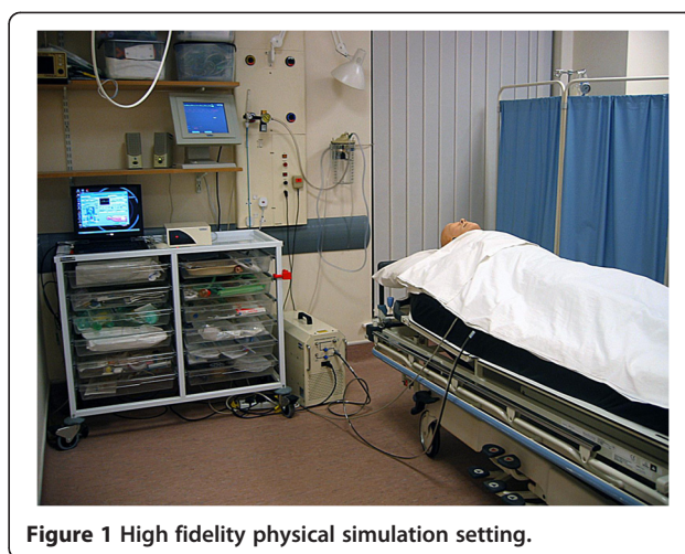
Figure 1 High fidelity physical simulation setting.

Note: Tolerance is 1 - R^2 , the complement of the proportion of variance explained in a multiple linear regression predicting the cue from all the other cues.