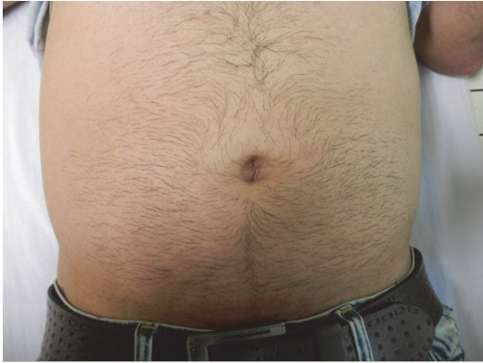
FIGURE 1: Preoperation picture.