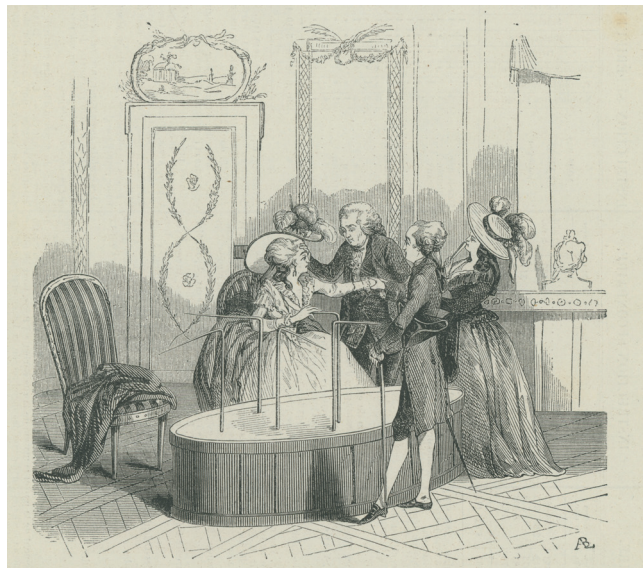
Figure 1. Franz Mesmer's tub according to a 1784 French engraving. The tub (baquet) contained immersed bottles with magnetized water and iron fillings. Iron rods coming out of the tub were directed towards body parts and harmonica music was played while the patients held hands. Mesmer, who had fled from Vienna to Paris, was considered a genius by some and a charlatan by others. Eight members from the Académie de Médecine and the Académie des Sciences demonstrated that the tingling, trembling, tears, and even convulsions observed in persons who knew they were being magnetized were absent when subjects were magnetized while being unaware of it.

Clinical illustration 1. This 45 year-old patient is in ambulatory care because of severe depression. He had been doing clerical work for 15 years but lost this job because of conflicts with his boss. Psychotherapy, antidepressants, and augmentation treatment were without benefit. He consulted another medical doctor who ordered tests measuring neurotransmitters and their metabolites, amino acids, and immune globulins, and prescribed unusual treatment such as micronutrition and hormones. This gave the patient a feeling of being well taken care of, although his depression did not improve.