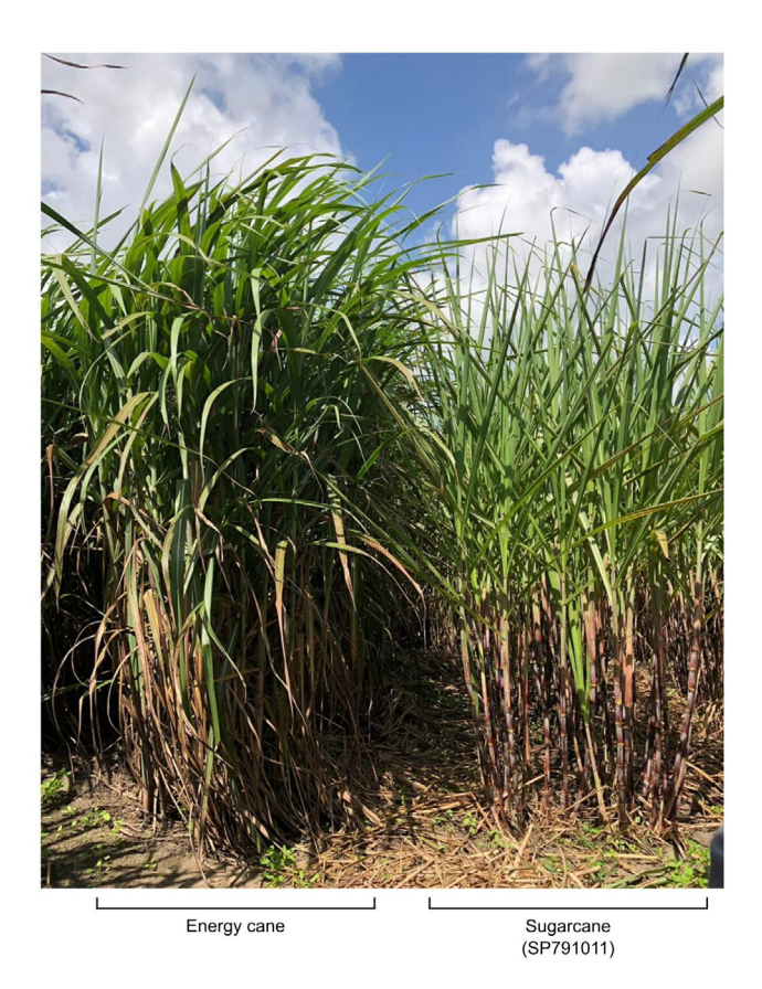
Fig. 1. An energy cane RB hybrid and a sugarcane variety (SP791011) at six months after planting, under field conditions at the experimental site 'Estação de Floração e Cruzamento da Serra do Ouro' (lat 9° 13' S, long 35° 50' W, alt 450 m asl) in Alagoas, Brazil.

Compared to sugarcane commercial varieties, energy canes have higher ratooning ability and number of tillers [27,29,30,33], which combined are very important in defining total biomass yield (Fig. 1). Because this crop is "vegetative propagation based", this characteristic is also important in overcoming one of the most significant economic constraints in the cane cultivation: clonal multiplication [27]. In addition, there is also a profound difference regarding the root systems; energy cane produced an abundant and vigorous root system, surpassing the conventional cane in