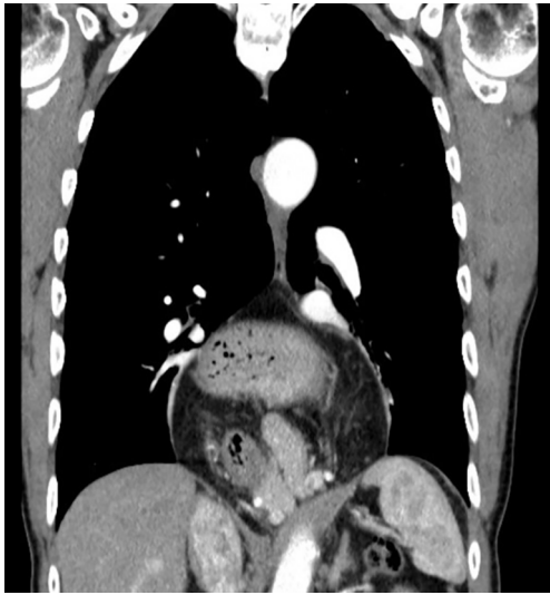
Figure 2 Large type 4 paraesophageal hernia approached via robotic repair.

conversions into open or laparoscopic, with an average length of stay of 4 days. There were 9 patients suffering from postoperative complications, often multiple complications in the same patient. Of these 9, 4 had major complications, which include pulmonary embolus, septic thrombophlebitis, diarrhea, acute lung injury and C. difficile colitis. Similarly, a study conducted by Seetharamaiah et al. conveyed comparable results (12). The report included 19 patients undergoing robotic surgery. The mean operative time was 185 min with 4.3 days average hospital stay. There was 1 conversion case to open repair for partial gastric resection. There were 2 postoperative complications, which included dysphagia requiring dilatation and 1 pleural injury. Finally, Morelli et al. reported 6 patients undergoing giant hiatal hernia repair using robotic surgery (76). The mean operative time was 182 min, with a mean hospitalization stay of 6 days. There were no postoperative complications or symptoms.