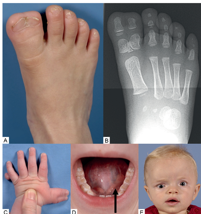
Figure 2. Example of preaxial polydactyly of the foot and some related phenotypes.

22 patients never received a genetic test or test results were not documented. In 5 of the 6 patients with unilateral PPD