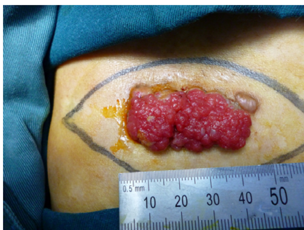
Figure 1 Clinical appearance before surgery. Notes: The photograph shows a large, sessile, moist, pinkish mass with a few hemorrhagic areas in the right lower abdomen.

SCAP is an uncommon skin adnexal tumor of sweat gland origin that usually occurs as a solitary lesion. Although most