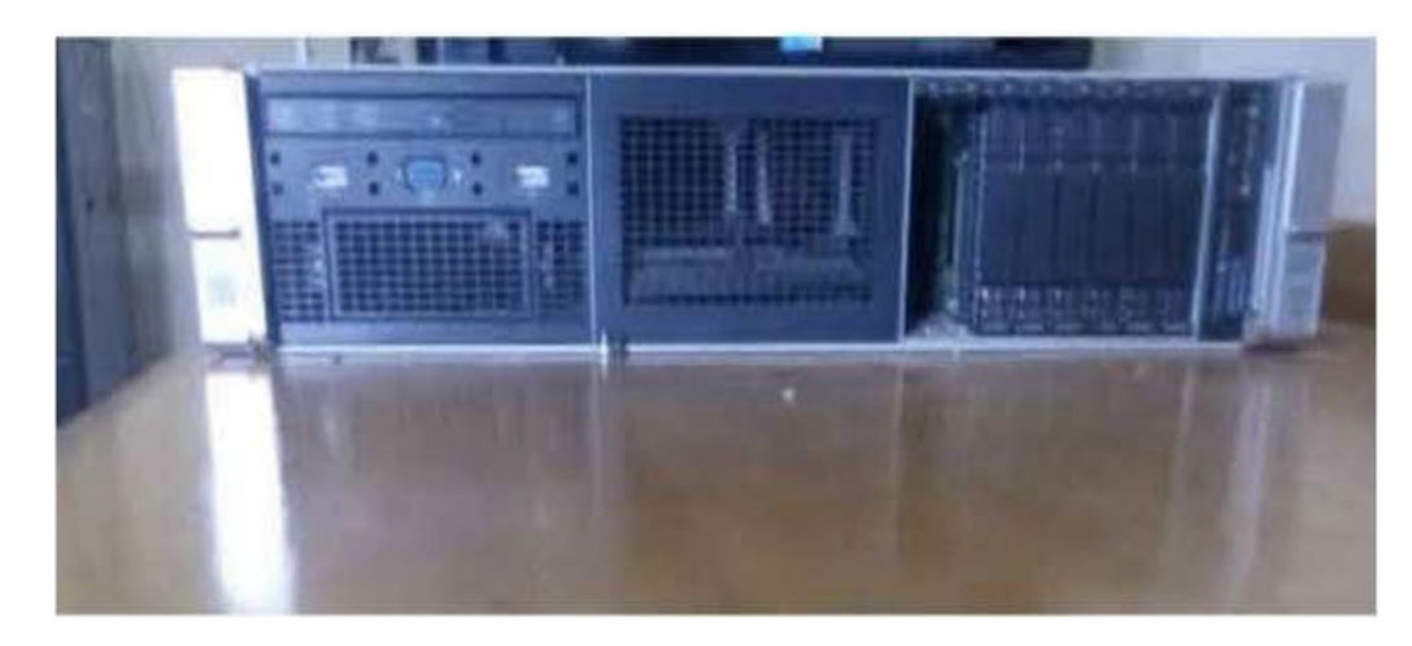
Fig. 2. Dedicated RedCap Server at JUTH