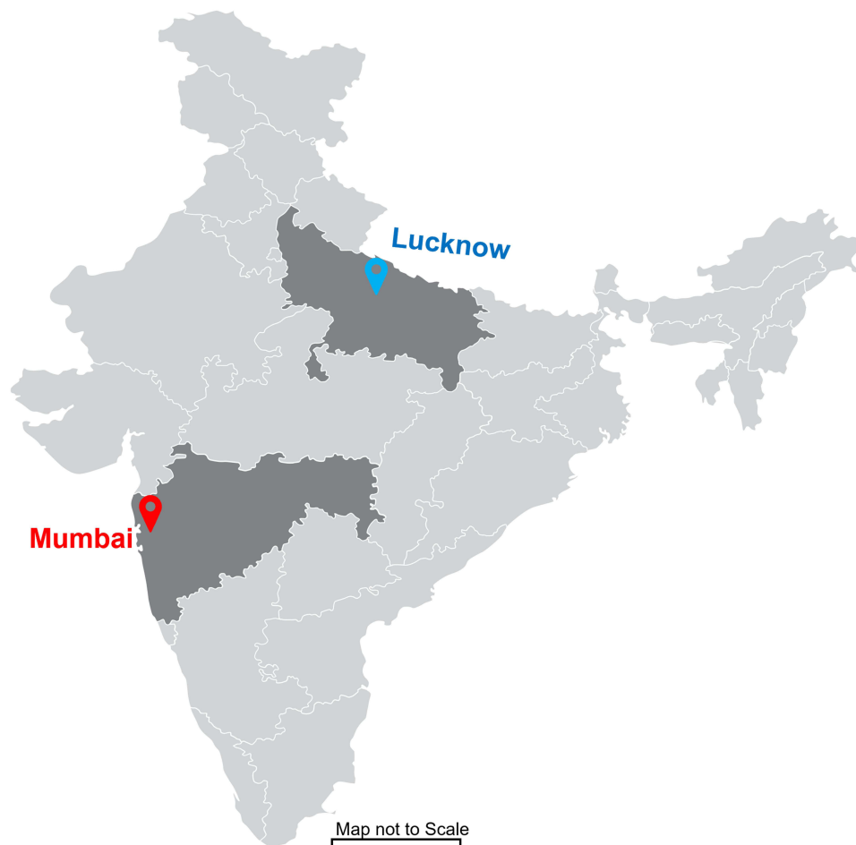
Figure 1 Geospatial Map of India indicating the location of two areas from where the clinical strains of M. tuberculosis have been obtained.