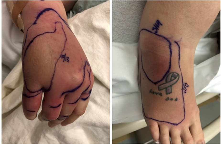
FIGURE 1: Erythematous and edematous rash on right hand and right ankle

On presentation to the inpatient unit, due to infectious disease, her antibiotics changed to daptomycin and meropenem for broad coverage. Further history included no recent travel, infection, or exposure to pets. She denied insect bites and close contacts with similar symptoms. Her medical history was significant for hypertension, treated with lifestyle changes, and gestational diabetes. Social history was negative for smoking and drug use, and she had no family history of autoimmune disease. There was no history of sexually transmitted infections. Physical examination revealed an edematous, light pink plaque on the right dorsal hand and wrist that spread proximally up her arm with satellite firm, pink papules on the forearm. Numerous similar appearing papules were present on the left forearm. A small lesion was present near her right fifth MCP that had a gray, dusky appearing hue. On her right foot, there was a dark red/tan edematous plaque. Lab results on admission included an unremarkable complete blood count (CBC) and comprehensive metabolic panel (CMP). Differentials considered were broad, and included cellulitis, parvovirus, Lyme disease, disseminated gonococcal infection, and autoimmune etiologies.