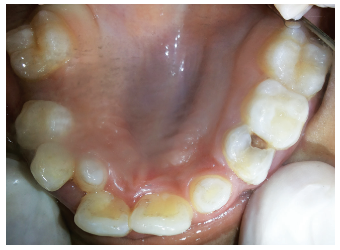
Fig. 5: Intraoral photograph showing high arched palate, peg shaped laterals, missing 55 and carious 64