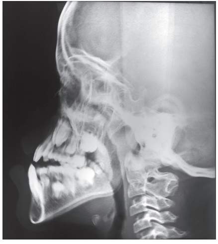
Fig. 10: Lateral cephalogram of the patient showing fusion of cervical vertebra 2 and 3 (C2 and C3)

and extraction of 64 was advised. Radiovisiography of 55 tooth region (Fig. 8) did not show bone overlying the erupting premolar, hence there was no need for the space maintainer in that region. Radiographic findings