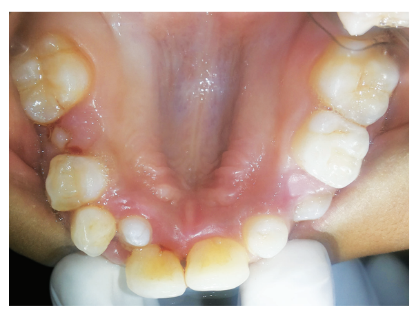
Fig. 12: Follow-up photograph

The phenotypic features of Crouzon's syndrome may be absent at birth and may evolve gradually during the first few years of life.<sup>10,11</sup> It is commonly inherited as an autosomal dominant trait, with complete penetrance and a variable expressivity, but about one third of the cases do arise spontaneously. The male to female preponderance is 3:1.<sup>12</sup> With the advent of molecular technologies, the gene for Crouzon's syndrome could be localized to the FGFR2 gene, at the chromosomal locus 10q25.3-q26, and more than 30 different mutations within the gene have been documented in separate families.<sup>13</sup> Hypertelorism was a universal finding in the affected individuals and is thought to arise due to a decrease in growth of the sphenozygomatic and sphenotemporal sutures.<sup>5</sup> The appearance of an infant with Crouzon's syndrome can vary in severity from a mild presentation with subtle midface deficiency to severe forms with multiple cranial sutures fused and marked midface and eye problems. Upper airway obstruction can lead to acute respiratory distress and the presence of mental retardation is rare in these children.14