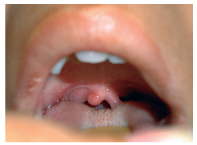
Fig. 7: Intraoral photograph showing bifid uvula