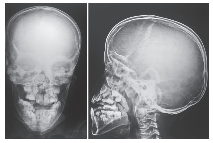
Fig. 1: PA Skull view and Lateral skull view showing hypoplastic maxilla, relative mandibular prognathism and cerebral impressions

Clinical examination revealed hypertelorism, external strabismus, optical atrophy, hypoplastic malar process, hypoplastic maxilla, relative mandibular prognathism, depressed nasal bridge, deviated nasal septum, short upper lip, and long philtrum (Fig. 1). No digital abnormalities were present. Extraoral examination revealed elliptical-shaped head, with dolichofacial growth pattern, and concave facial profile (Fig. 2).