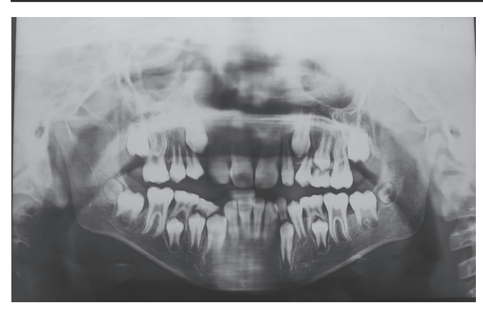
Fig. 11: Postoperative intraoral photograph

Crouzon's Syndrome: A Rare Genetic Disorder