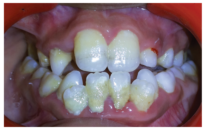
Fig. 4: Intraoral photograph showing edge to edge incisal relationship