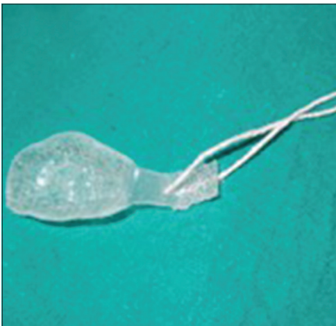
Figure 9: Clear soft feeding obturator with safety thread attached