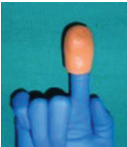
Figure 3: Dental putty loaded on the index finger