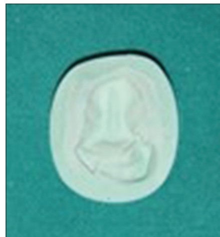
Figure 8: Master cast