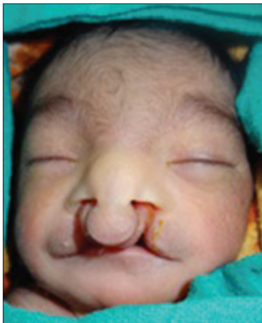
Figure 1: Extraoral view showing bilateral cleft lip

STD, 3M ESPE, USA) was mixed and loaded on the index finger and an adequately large piece of gauze was wrapped all over the loaded impression material with loose ends wrapped toward the hand [Figures 3 and 4]. The gauze permitted control over the material and restricted the excessive displacement of impression material toward the nasal cavity and pharynx [Figure 5]. Thick consistency of the impression material did not permit leakage of material through the gauze and kept it within the flexible confines of the gauze. The child was encouraged to perform sucking during the impression making. The functional movements facilitated recording of tissue details and undercuts. The resultant sucking pressure embedded the gauze threads in the putty impression material as the easily moldable gauge did not offer any resistance. After the impression material was set, the impression was removed in toto from the patient's mouth [Figures 6 and 7]. Then, the impression was poured in dental stone (Kalstone, Kalabhai Karson Pvt Ltd), Mumbai, Maharashtra, India) and the master cast