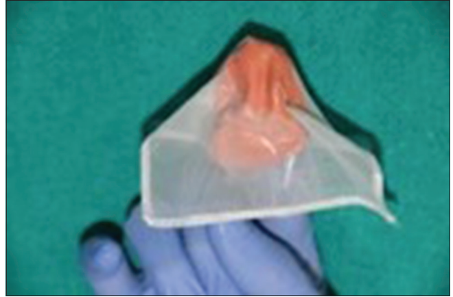
Figure 6: Hybrid impression retrieved in toto