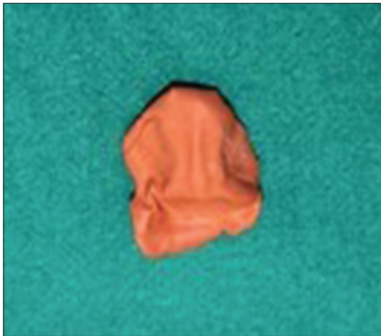
Figure 7: Dental putty maxillary impression