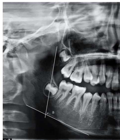
Fig. 2: Antegonial Index (a); (Length of “a” in mm).

Mental index (MI): mandibular cortical width at the mental region. It is one of the quantitative indices used