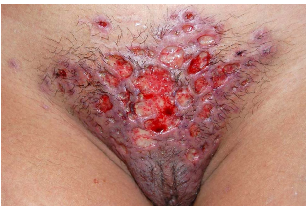
Figure 2 Pubic area with succulent ulcerated nodules with seropurulent discharge 2 days after beginning of antifungal treatment.

In all seven patients, direct examination revealed hyphae. Cultures were positive in six cases; the isolates were identified as T. interdigitale . The strains were subjected to sequence analysis for further investigation. When compared with the signature polymorphisms published by Heidemann et al , 11 three