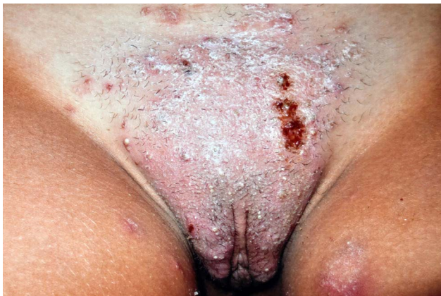
Figure 1 Erythematous scaling plaques and follicular pustules in an 18-year-old patient.

hospitalised for a total of 14 days. After 6 weeks of itraconazole and 3 weeks of prednisone, the lesions healed with marked scarring.