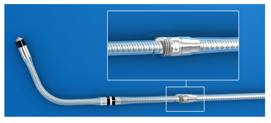
Figure 2 Model 20066 left ventricular lead with a close-up of the helix fixation mechanism.