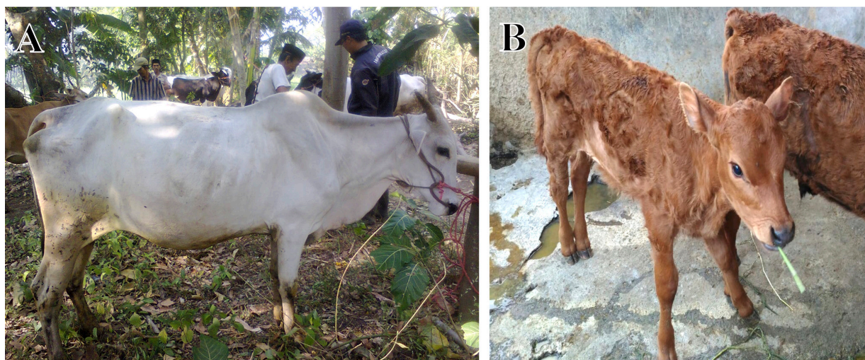
Fig. 1. An Ongole cross dam (A) used as a recipient for embryo transfer and a Limousin calf (B) born by embryo transfer.

Before the present study, the same research group performed an experiment using Holstein-Friesian dairy cows (60 to 90 after the last parturition) as recipients for ET using Simmental embryos purchased from the same company with the same materials and protocol as those in the present study [4]. Based on the data of the previous experiment, the pregnancy rate was 55% (11 out of 20 dairy cows), which is high compared with that (35%, 7 out of 20 beef cows) in the present study. However, there was no significant difference ( P=0.204 on the Chi-square test and P=0.124 on the odds ratio) of the pregnancy rate between these two types of cows probably due to a small number of animals. The change in the progesterone concentration in the dairy cows (Fig. 2B) was similar to that in the beef cows in the present study (Fig. 2A). The serum progesterone concentration (ng/ml) was 0.44 \pm 0.40 , 3.53 \pm 2.06 , and 2.44 \pm 1.05 on days 0, 7, and 21, respectively, in the nonpregnant dairy cows, whereas 0.19 \pm 0.45 , 6.64 \pm 3.87 , and 18.7 \pm 11.7 on days 0, 7, and 21, respectively, in the pregnant dairy cows. There was a significant difference in the