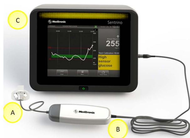
Figure 1 Components of the Sentrino continuous glucose management system: sensor (A), processor cable (B), and monitor (C).

Sentrino CGM system (Medtronic Minimed, Northridge, USA) consists of three components: a subcutaneous continuous glucose sensor, the processor cable, and the monitor. The sensor is placed in the subcutaneous layer of a patient and generates an electrochemical signal representing the glucose level of the interstitial fluid via the glucose oxidase reaction. The sensor is connected to the processor cable, which captures and digitizes the