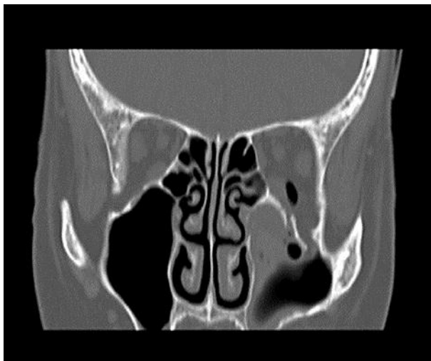
Fig. 1. Head computed tomography image immediately after injury. A blowout fracture of the inferior wall of the left orbit accompanied by soft tissue prolapsing into the orbit is presented. Accumulated hemorrhage in the maxillary sinus is also observed.