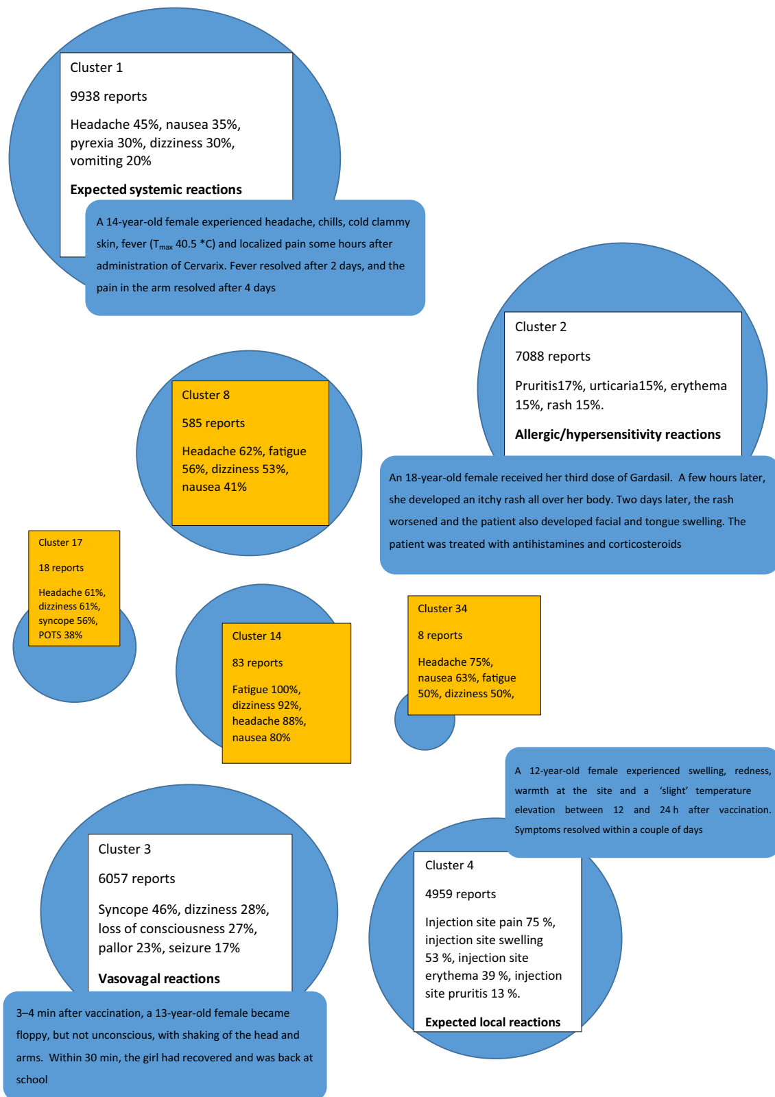
Fig. 1 Diagram of the four largest clusters and the four smaller clusters of interest. The four largest clusters described well characterised clinical scenarios which are included in the product labels for HPV vaccines. Representative case narratives have been chosen to

exemplify the types of cases included in these clusters. T_{max} Maximal recorded body temperature, POTS postural orthostatic tachycardia syndrome