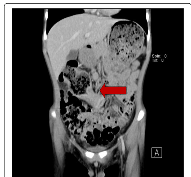
Fig. 2 Contrast-enhanced computed tomography (CT) scan of the abdomen and pelvis showed annular wall thickening in the transverse colon with mild pericolic fat infiltration and visible clustered lymph nodes in the adjacent mesenteric space, compatible with transverse colon cancer