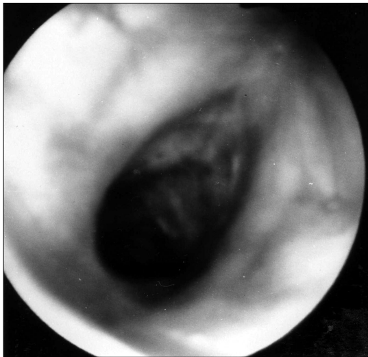
Fig. 2. Tracheoscopic image of preoperative subglottic stenosis.

preoperative SS is shown in Fig. 2. Both the CO 2 and Nd: YAG laser procedures took no longer than 20 minutes.