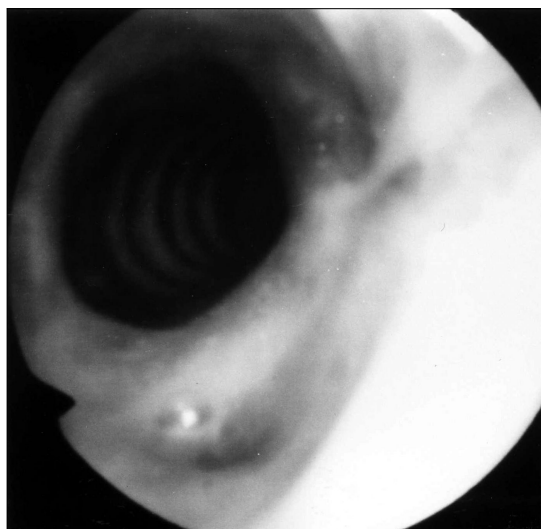
Fig. 4. Tracheoscopic image of postoperative subglottic stenosis.

tissue. Another patient who had preoperative tracheostomy was decannulated after two interventions by CO 2 laser.