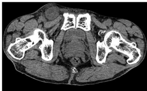
Figure 1. Computed tomography revealed a quasi-circular hypodense lesion of approximately 6.0 \times 4.0 \times 4.0 \text{ cm} located medial to the right femoral vessels.

A 69-year-old man with 1-year history of a retractable mass in the right groin arrived at our emergency department with a 5-day history of progressively aggravated right inguinal pain associated with the appearance of an incarcerated right femoral hernia. He denied abdominal pain and distension, nausea and vomiting, fever, and any other signs of bowel obstruction. He had no other relevant medical history. His vital signs were normal, and his body mass index was 18.0 \text{ kg/m}^2 . Physical examination revealed a non-reducible tender lump in the right groin below the level of the right inguinal ligament. The lump was approximately 6 \times 4 \text{ cm} in size, warm, and erythematous. Routine blood examination revealed a white cell count of 8.62 \times 10^9/\text{L} and neutrophilic granulocyte percentage of 75.7%. A computed tomography scan revealed a quasi-circular hypodense lesion of approximately 6.0 \times 4.0 \times 4.0 \text{ cm} located medial to the right femoral vessels and connected to the abdominal intestines (Figures 1–3).