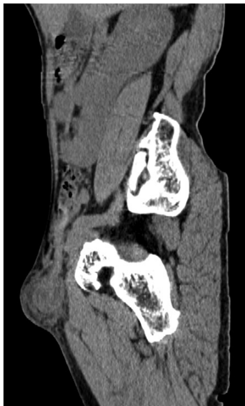
Figure 3. Computed tomography revealed a quasi-circular hypodense lesion of approximately 6.0 \times 4.0 \times 4.0 cm located medial to the right femoral vessels.

Preoperative prophylactic antibiotics were administered. An oblique incision was made above the inguinal ligament in the right groin, and an anterior approach was performed. Dissection in layers revealed an incarcerated right femoral hernia under the inguinal ligament, and the hernia could not be reduced from below. The peritoneum was dissected through Hesselbach's triangle, revealing a non-reducible appendix in the femoral canal without signs of peritonitis. The tip of the appendix was purulent and swollen. After yellow-white purulent fluid was extracted by fine needle puncture from the hernia sac, the tip of the appendix was still unable to be reduced because the