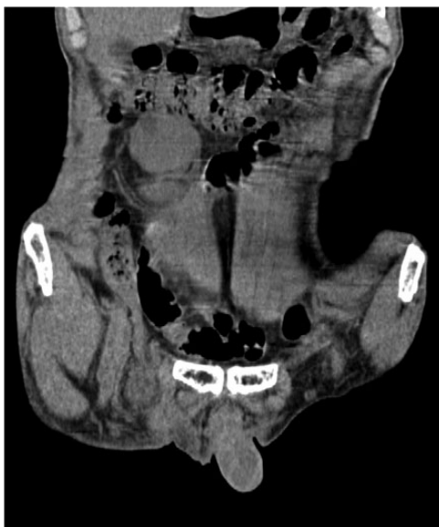
Figure 2. Computed tomography revealed a quasi-circular hypodense lesion of approximately 6.0 \times 4.0 \times 4.0 \text{ cm} located medial to the right femoral vessels.

There were no signs of intestinal obstruction.