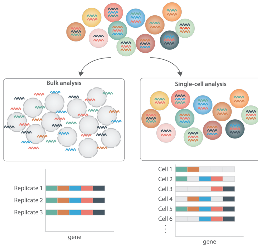
Figure 1. Cellular heterogeneity can be resolved by single-cell molecular profiling. Classical bulk gene expression analysis generates population average measurements, which obscure any information about heterogeneity between individual cells. Importantly, cellular heterogeneity is pervasive across many biological settings, including both normal and malignant hematopoiesis. Modern single-cell molecular profiling technologies can resolve cell-to-cell heterogeneity, and thus provide new insights into normal differentiation processes and their underlying regulatory networks, cellular responses to external signals and the heterogeneous cell states present during leukemia development.

single-cell level, and used this approach to highlight the promiscuous nature of multipotent progenitor cells, whereby single multipotent cells expressed multiple “lineage-specific” gene programs preceding commitment to a specific cell lineage. 14 This was a landmark paper, which unequivocally showed that the different lineage programs could be detected in one individual cell rather than specific subpopulations of the progenitor compartment.