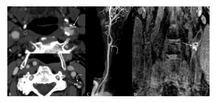
Figure 1 Examples of vulnerability plaque features on CTA and MRA imaging. Ulcerations (A) appear as focal defects in the plaque that may be regular or irregular (arrow). Low-density plaque components (curved arrow), (B) are notably hypodense, and are often surrounded by peripheral calcifications (dashed arrow). Even plaques that cause minimal luminal narrowing (arrow), (C) may demonstrate large intraplaque haemorrhage on coronal MPRAGE images (D). CTA, CT angiography; MPRAGE, magnetisation-prepared rapid acquisition with gradient echo; MRA, MR angiography.

Preoperative imaging findings in the carotid arteries ipsilateral and contralateral to the ischaemic events are outlined in table 1. Vulnerability plaque features on CTA and MRA imaging are demonstrated in figure 1. CTA was performed in 21/32 patients (65.6%), MRA and/or MR VWI in 30/32 patients (93.7%) and MR with MPRAGE in 15/32 patients (46.8%). Symptomatic plaques were on the left side in 23/32 patients (71.8%). The median degree of arterial stenosis ipsilateral to the ischaemic event was 30.0 (IQR 20.0–40.0) compared with 22.5 (IQR 10.0–50.0) on the contralateral side. There was no correlation between the presence of IPH and the degree of stenosis ipsilateral to the ischaemic event (p=0.601). Seven patients (21.9%) showed LDP in bilateral carotids. There was no correlation between the