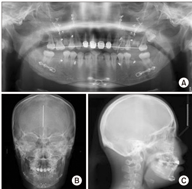
Fig. 1. Images produced three weeks after surgery in the study patient. A. Panoramic x-ray. B. Posteroanterior cephalogram. C. Lateral cephalograms.

A 30-year-old female underwent Le Fort I osteotomy and bilateral sagittal split ramus osteotomy at a local dental clinic.