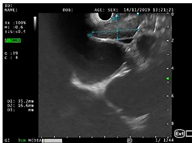
Fig. 1. EUS (linear array, transesophageal view – station 7): crescent-shaped lymph node, with 35 × 17 mm and a hypoechoic homogeneous echo pattern.

A 38-year-old man with a past history of a surgically removed duodenal GIST (AJCC stage 1, R0) was referred for EUS-guided sampling for characterization of several enlarged mediastinal lymph nodes, documented on computed tomography (CT). The patient was asymptomatic and had no lung lesions or abdominal lymphadenopathies on CT. EUS documented several coalescent, crescent-shaped lymph nodes in the posterior mediastinum, with a hypoechoic homogeneous pattern, the largest with 35 × 17 mm in the subcarinal station (Fig. 1). FNB was performed using a 22-gauge fork-tip needle (SharkCore; Medtronic, Sunnyvale, CA), with three dedicated passes (until obtaining a macroscopic visible whitish core), using the fanning and stylet retraction techniques. Polymerase chain reaction for Mycobacterium tuberculosis and assessment of clonal B cell populations by flow cytometry were negative, and noncaseating granulomas with multinucleated giant cells, compatible with sarcoidosis, were documented on pathology (Fig. 2). Two weeks after EUS-FNB, the patient was admitted due to increasing retrosternal pain, fever (39°C), and progressive dysphagia. Serum inflammatory markers were elevated, and chest CT revealed a large subcarinal mass (54 × 45 mm) with heterogeneous liquefactive areas, consistent with a mediastinal abscess, in continuity with a thickened esophageal wall (Fig. 3). The patient was treated with intravenous